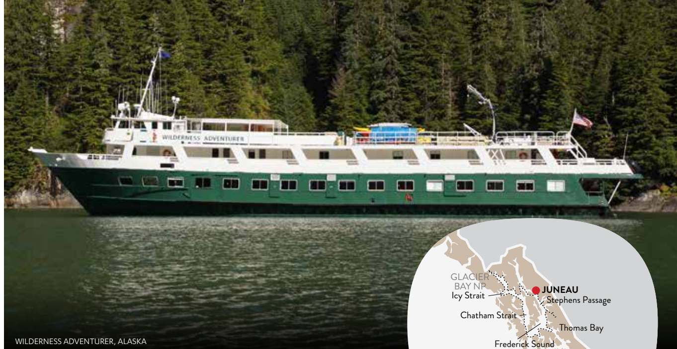
WILDERNESS ADVENTURER, ALASKA