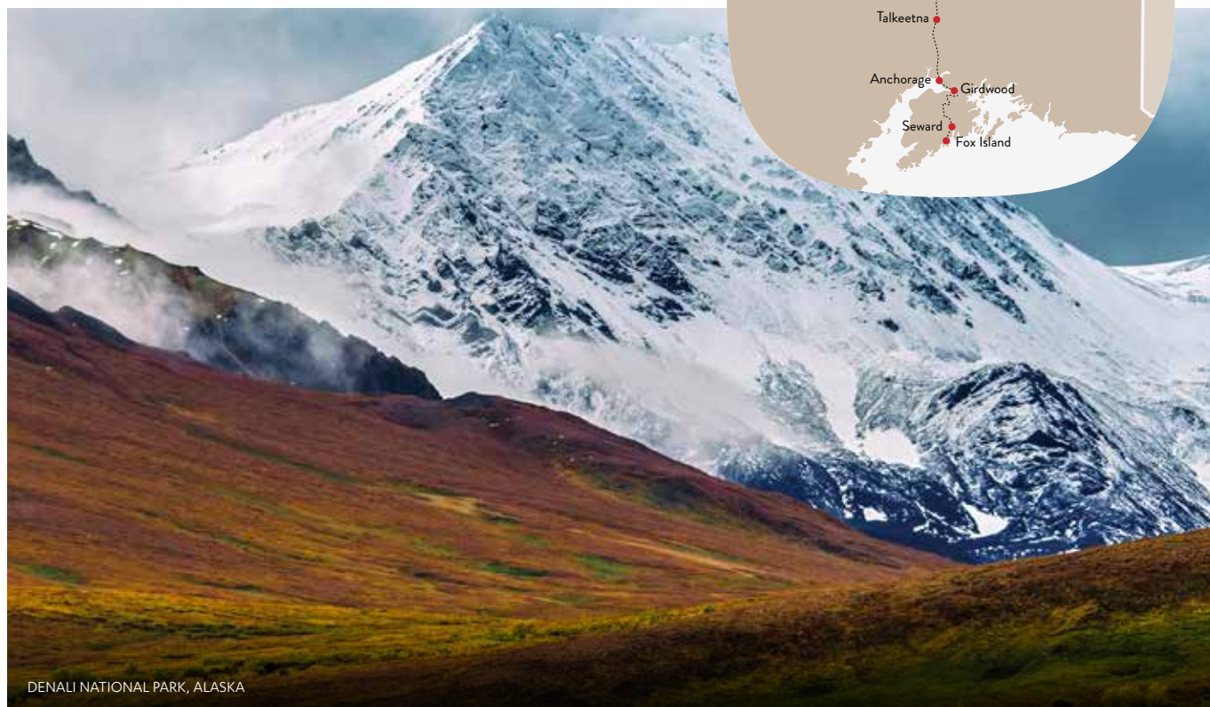
DENALI NATIONAL PARK, ALASKA