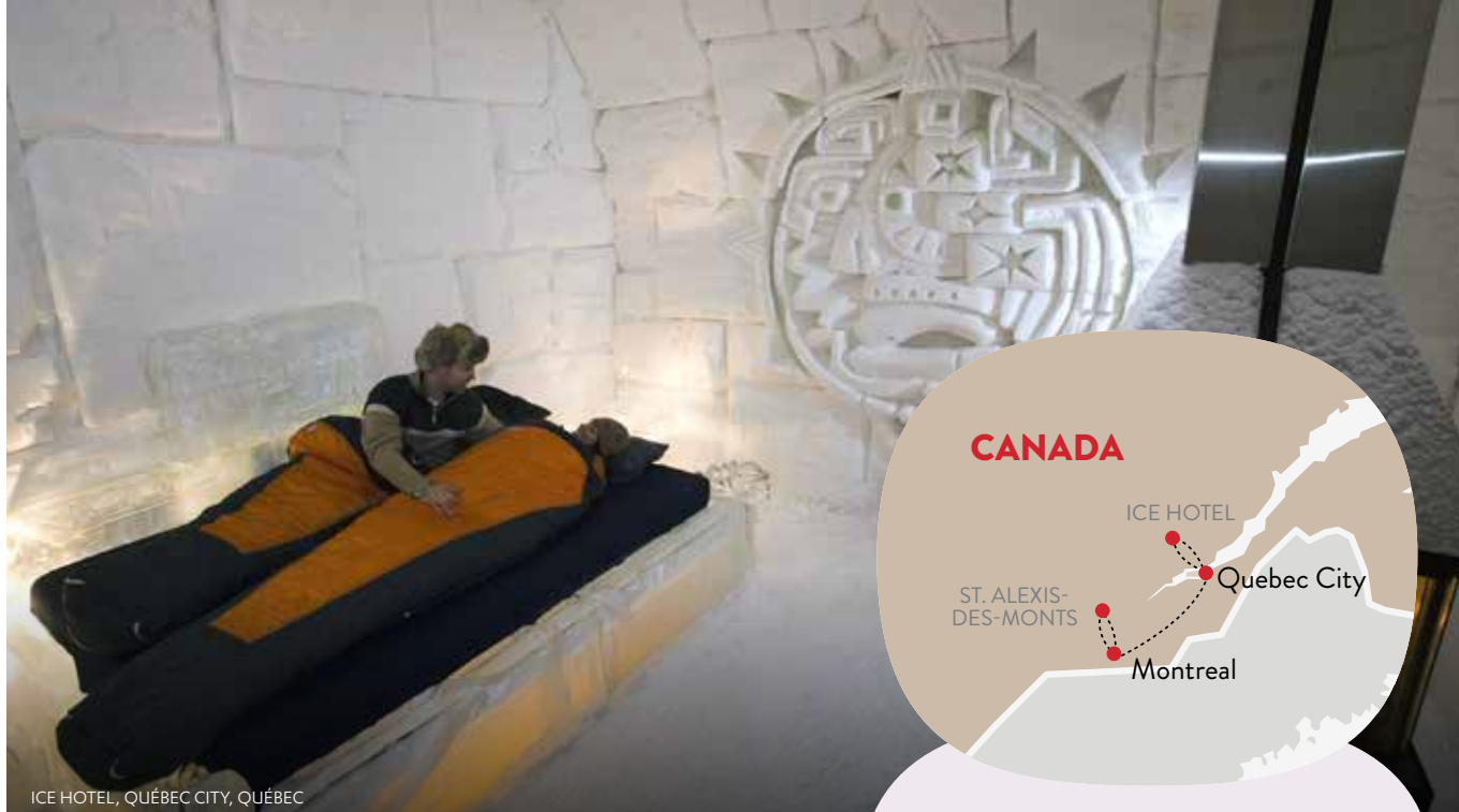
ICE HOTEL, QUÉBEC CITY, QUÉBEC