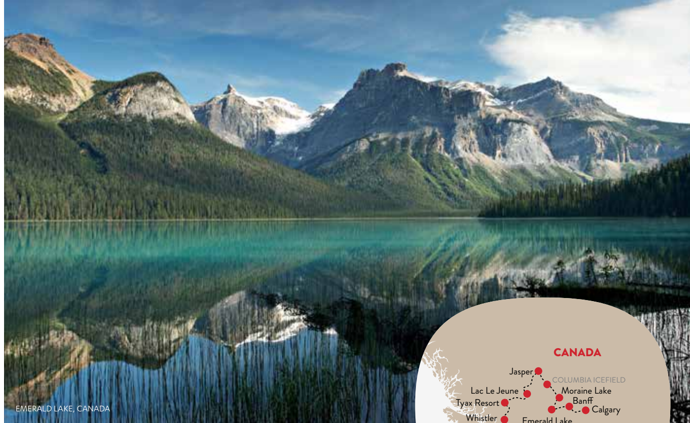
EMERALD LAKE, CANADA