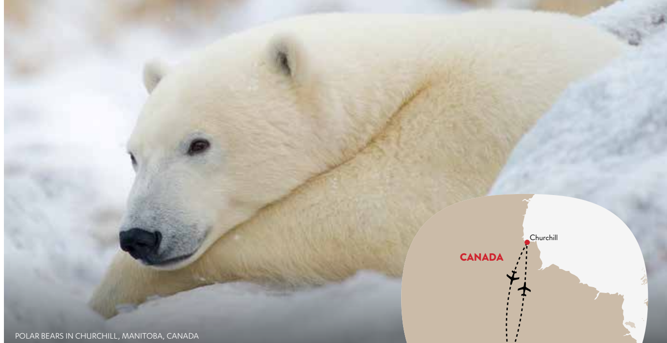
POLAR BEARS IN CHURCHILL, MANITOBA, CANADA